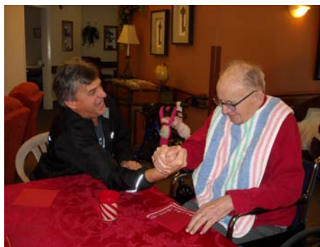
Dale & Son